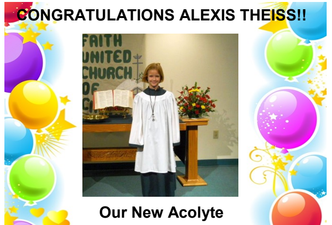
Our New Acolyte